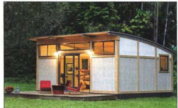
▲ Maximo Cabin: This 16-by-20-foot cabin has insulated walls and spruce-trimmed windows and door frame. The unit is designed to accommodate kitchen and bathroom fixtures, which can be added at additional cost. Other upgrades include deck modules, cypress wood trim, and exterior lighting. $32,500 base price. Cabin Fever, (305) 582-5293